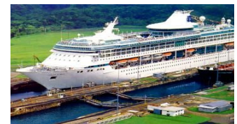
Panama Canal Transit 2 & 3/19