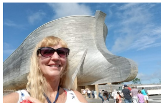
The Ark Encounter—Williamstown, KY