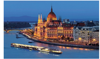
Danube River Cruise 9/18