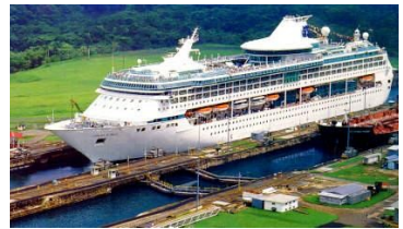
Panama Canal Transit 2 & 3/19