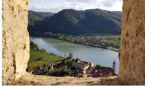
Danube view in Durnstein, Austria