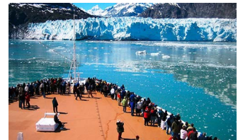
Alaska Cruise/Tour 6/19