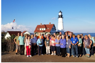
Portland Head Lighthouse, Maine