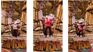
Branson, MO — Samson!