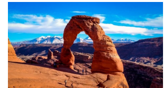
SW Canyon Country 9/19